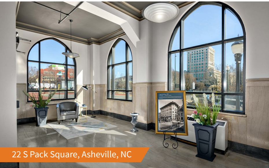
22 S Pack Square, Asheville, NC