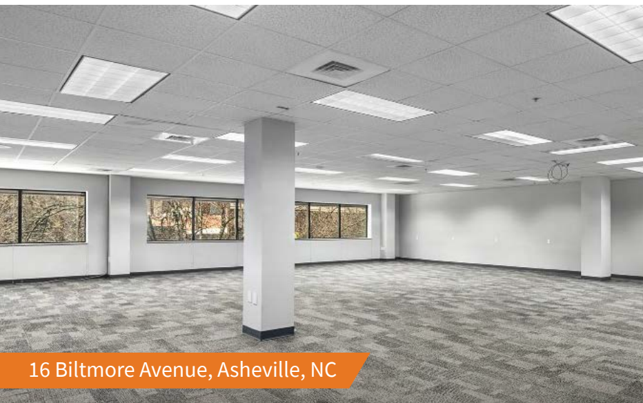
16 Biltmore Avenue, Asheville, NC