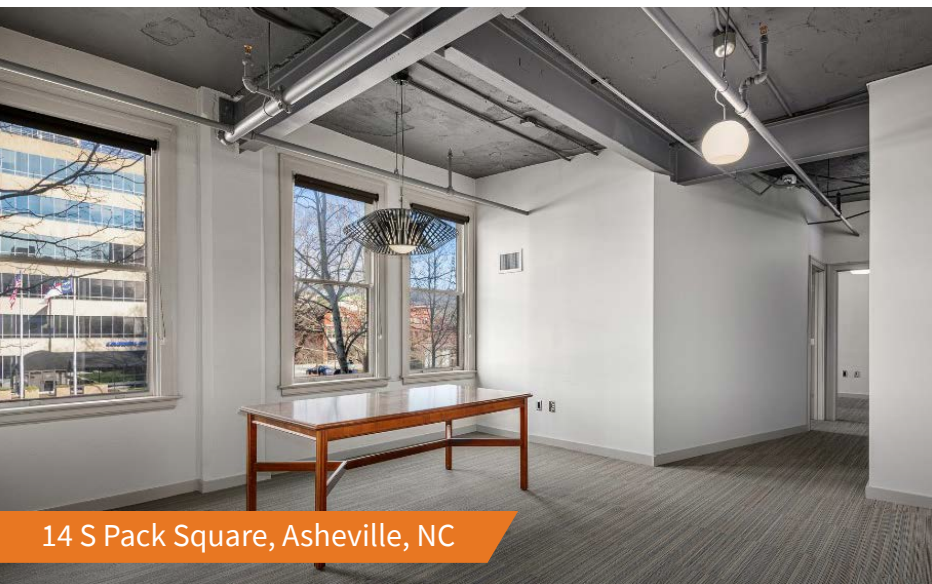
14 S Pack Square, Asheville, NC